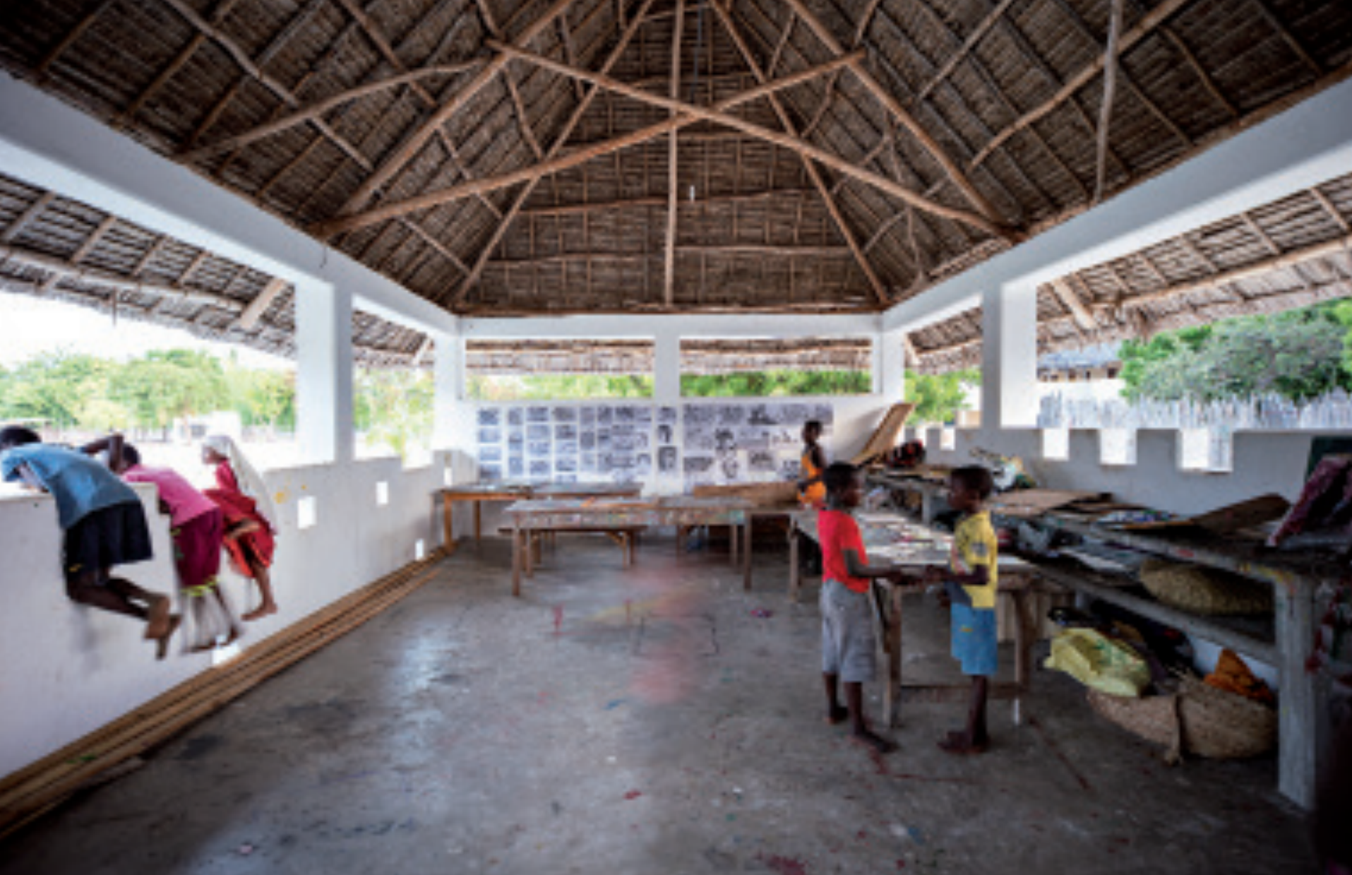
↑ The large premises of the former warehouse offer space for photo shootings and post-processing.