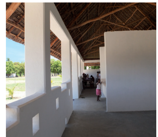
↑↑ The large premises of the former warehouse offer space for photo shootings and post-processing.